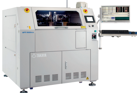
Flying Probe Tester 1

For EMS products, we provide OEM manufacturing services that meet the needs of customers' high-level technical applications with expertise and technical capabilities that we developed over the years, as well as our latest automated management system. We have been developing radio wave store security gates, self-sounding tags, HF bands, UHF bands, LF band RFID reader/writers, and various application system products since 1996. These products have been widely used in different fields, including security, FA and distribution. We contribute to the creation of added value in a variety of business models from OEM/ODM supply to contract development, EMS service, and system solutions as well as our own planned products. The in-circuit tester is an inspection device for printed circuit boards which checks for failures in manufacturing. The Flying Probe Tester, which is a flagship product