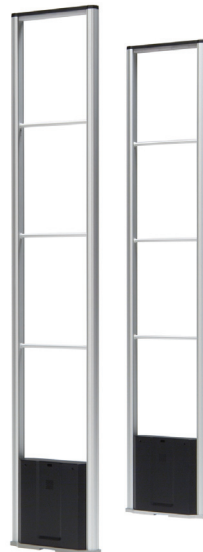
Anti-theft system (TSA1)

Our international strategy is a little bit different than those for companies such as Panasonic, Sony and other large-scale electronics manufacturers. These companies build overseas factories as manufacturing bases. As for us, we go overseas to seek out potential destination markets. We are now searching for partners in our RFID field in which we hold significant market share in Japan. For the Flying Probe Tester, we want to increase our sales not only in the United States and Europe, but also around the rest of the world, including Asia.